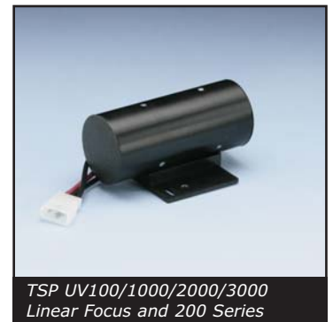
TSP UV100/1000/2000/3000 Linear Focus and 200 Series