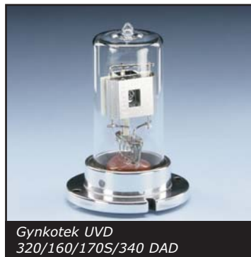
Gynkotek UVD 320/160/170S/340 DAD