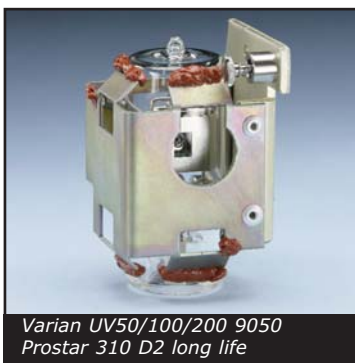
Varian UV50/100/200 9050 Prostar 310 D2 long life