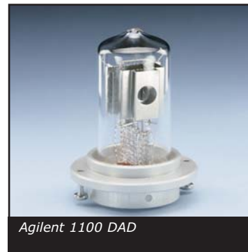
Agilent 1100 DAD