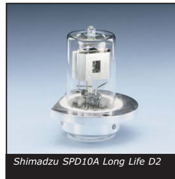
Shimadzu SPD10A Long Life D2