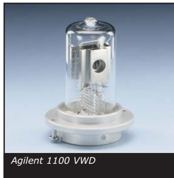
Agilent 1100 VWD