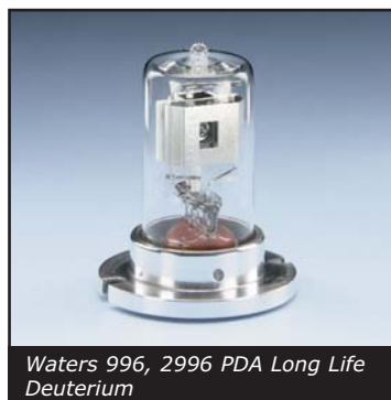
Waters 996, 2996 PDA Long Life Deuterium