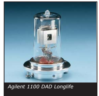
Agilent 1100 DAD Longlife