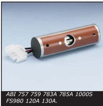
ABI 757 759 783A 785A 1000S FS980 120A 130A.