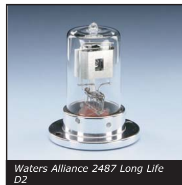
Waters Alliance 2487 Long Life D2